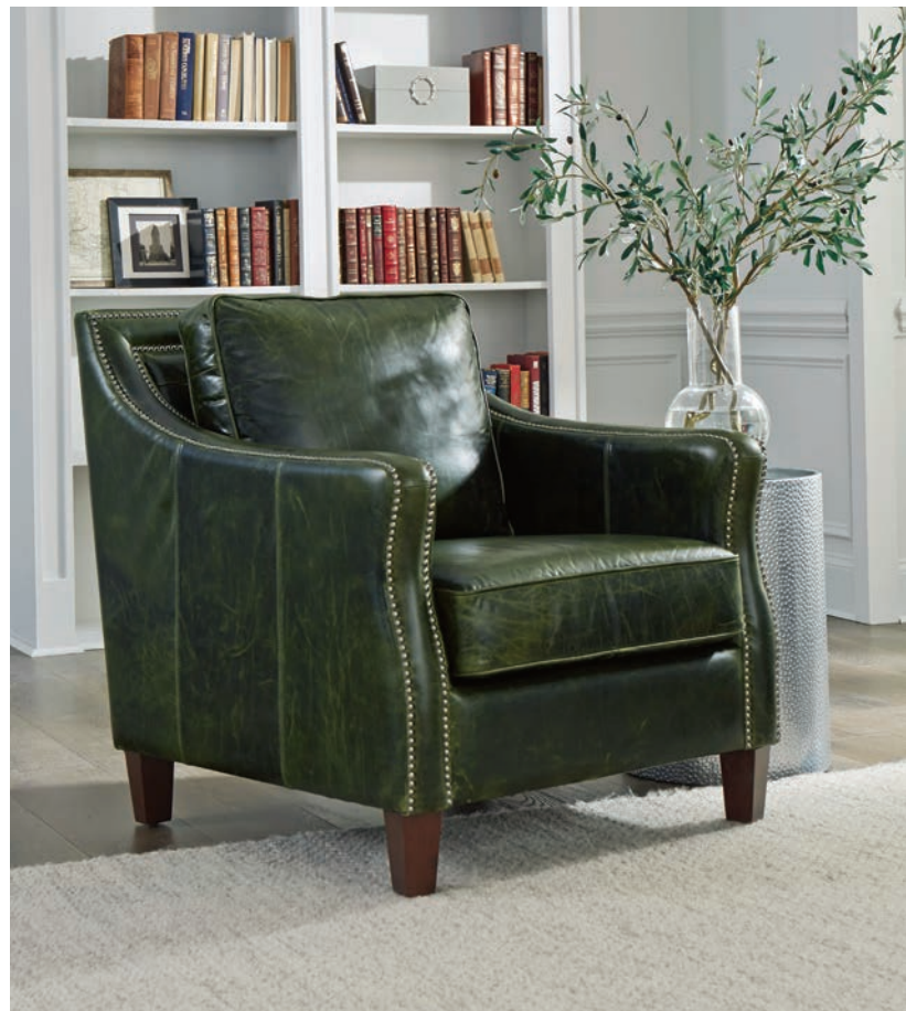
P904-682-1725 Miles Chair