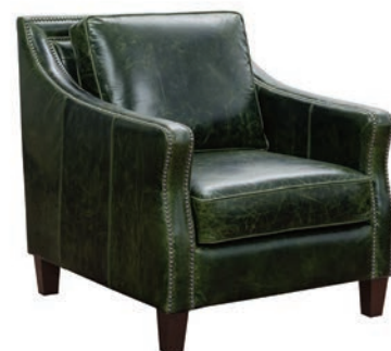
P904-682-1725 Miles Chair 33W x 39D x 36H