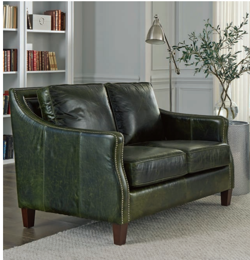
P904-681-1725 Miles Loveseat