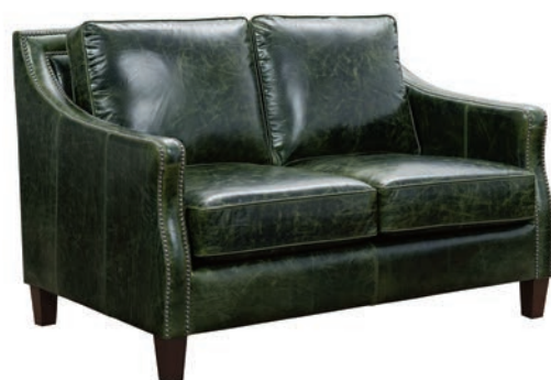
P904-681-1725 Miles Loveseat 57W x 39D x 36H