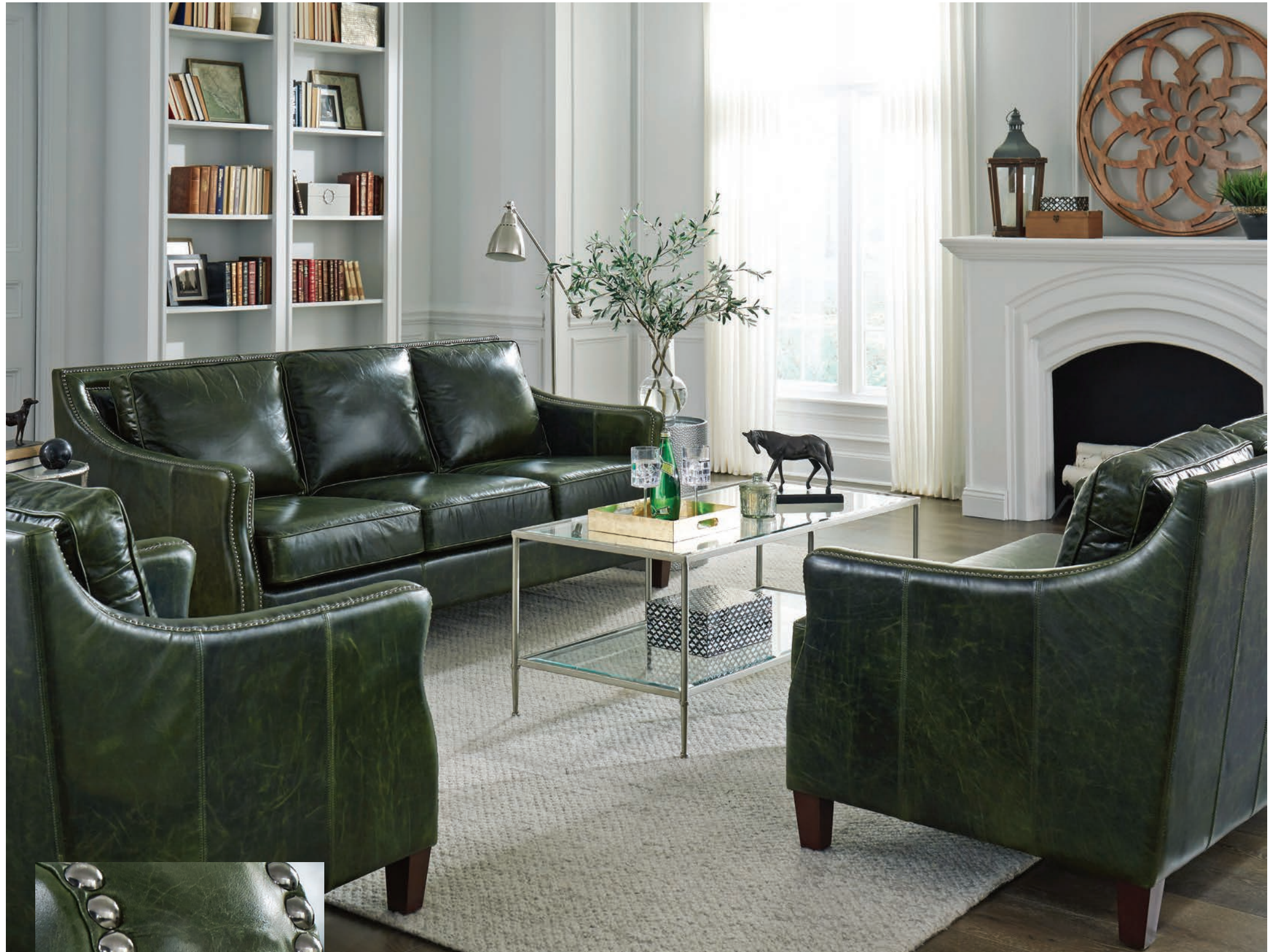
P904-680-1725 Miles Sofa