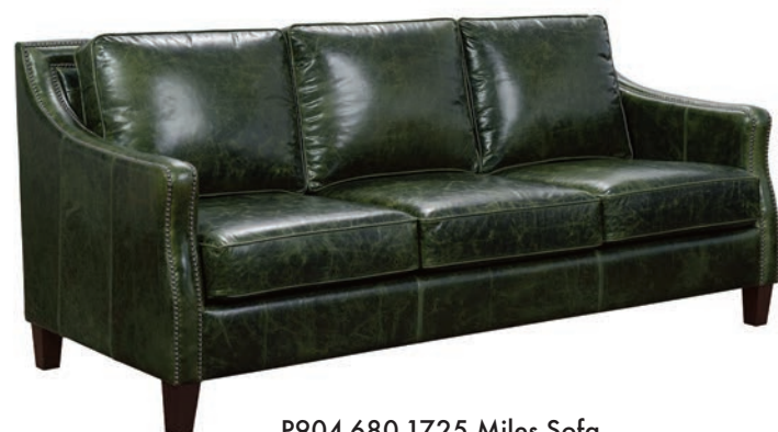
P904-680-1725 Miles Sofa 81W x 39D x 36H

Pulaski reserves the right to discontinue and change specifications at any time without notice. Due to differences in photographic and printing processes, furniture colors shown may vary from the actual finishes.