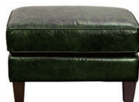
P904-683-1725 Miles Ottoman 29W x 21D x 20H